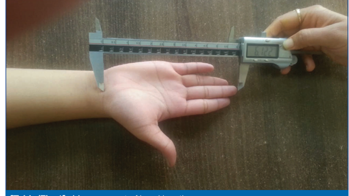
[Table/Fig-1]: Measurement of hand length.

Hand length: From distal wrist crease to distal end of the most anterior projecting point, i.e., tip of the middle finger [Table/Fig-1].